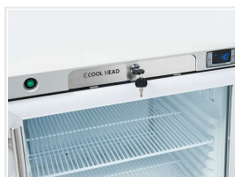
Main switch, digital thermostat and door lock fitted as standard