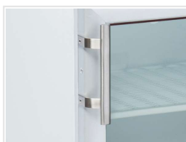
External cylindric handle in stainless steel (Steel color for X Version)