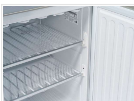
Fixed evaporator shelves